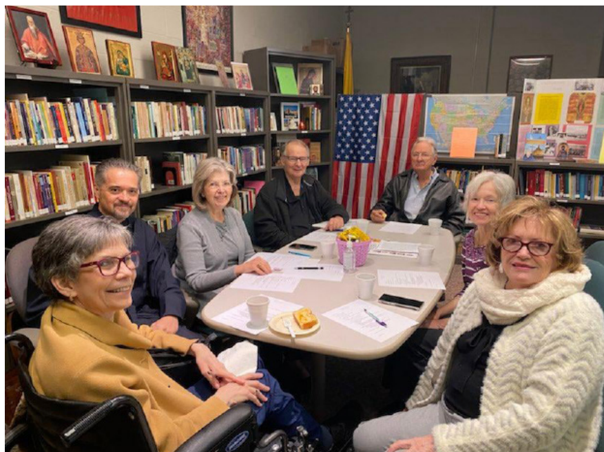
Bethany Ministry members plan visits to homebound.

This was a wonderful day for all, as we learned the holy tradition of prospora baking, a humbling and also a very prayerful and joyful service in our parish family. ■