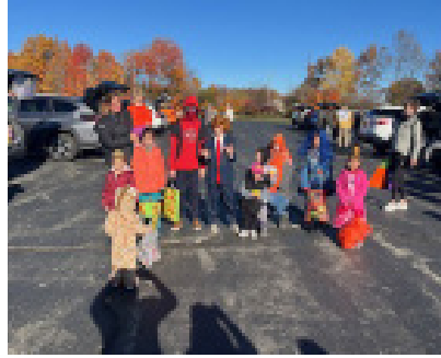
Parishioners and the children all had a wonderful time! ■

The annual Trunk & Treat was held on Sunday, Oct. 27 when the parishioners decorated the trunks of their cars and passed out treats to the children.