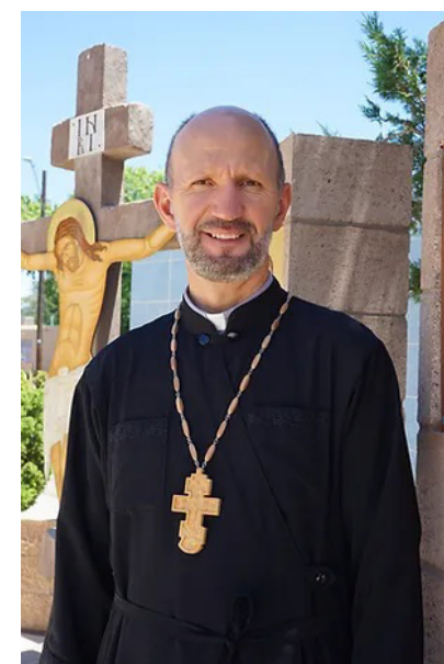
Bishop-elect Artur Bubnevych