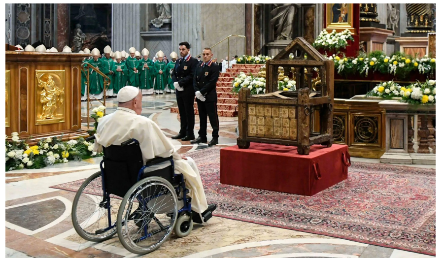
Pope Francis prays before the Chair of St. Peter, placed in front of the main altar of St. Peter's Basilica, after the closing Mass of the Synod of Bishops on synodality at the Vatican Oct. 27.