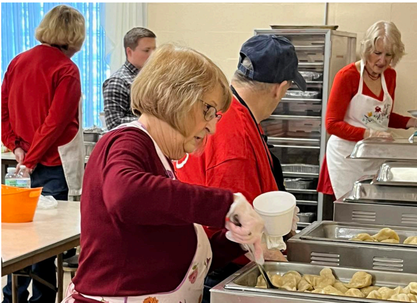
The first week of the Great Fast also means the first week of Fish Fry Fridays at many parishes of the Archeparchy of Pittsburgh, including the Lenten Kitchen at St. Elias in Munhall, Pa. on Feb. 20.

ST. ELIAS IN MUNHALL, PA. SERVES FAITHFUL ON FIRST FRIDAY OF LENT